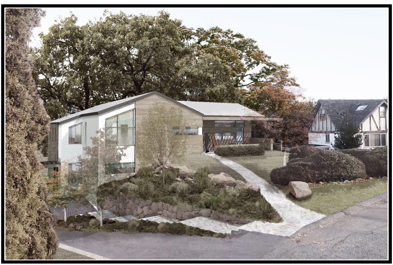
1535 Oak Crest Drive – Proposed Home