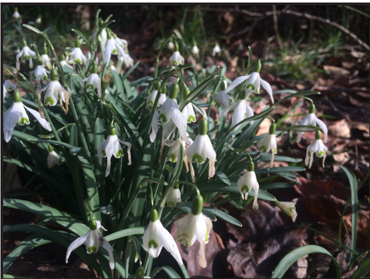
Spring snowdrops in Browning Park