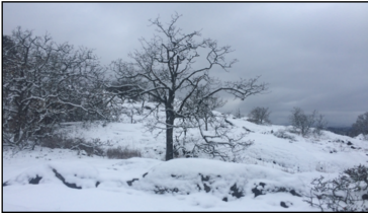
Winter scene on Mount Tolmie

The Camosun Community Association is a non-profit society with the mandate to promote, facilitate, support, and undertake activities that will enhance the quality of life for the residents in the Camosun Community within Saanich.